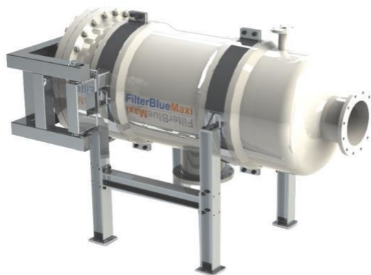
Approximate picture. End caps and height's choice will lead to the assembly of a product which could differ from those shown in figure