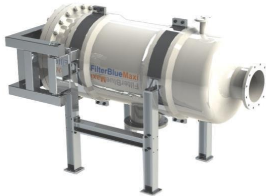
Approximate picture. End caps and height's choice will lead to the assembly of a product which could differ from those shown in figure