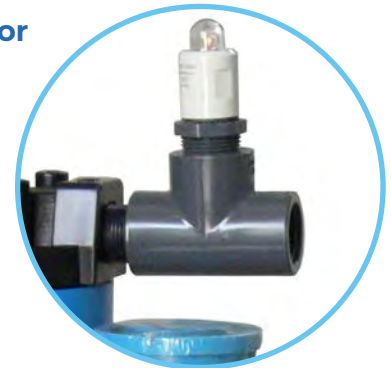
Quality light indicator