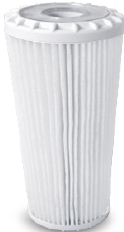
Approximate picture. End caps and height's choice will lead to the assembly of a product which could differ from those shown in figure