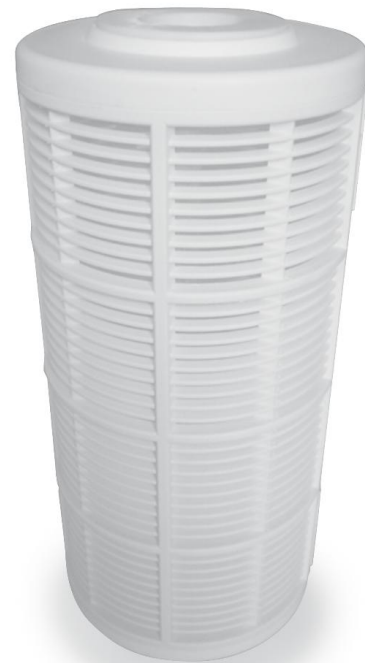
Approximate picture. End caps and height's choice will lead to the assembly of a product which could differ from those shown in figure