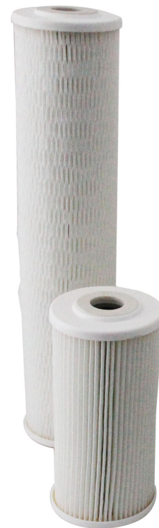
Approximate picture. End caps and height's choice will lead to the assembly of a product which could differ from those shown in figure