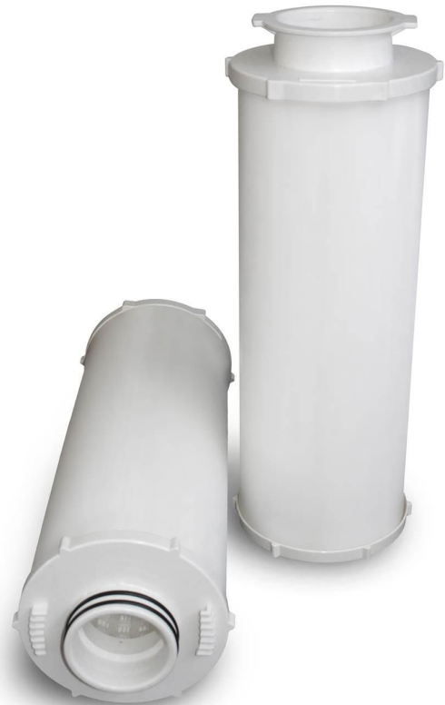
Approximate picture. End caps and height's choice will lead to the assembly of a product which could differ from those shown in figure